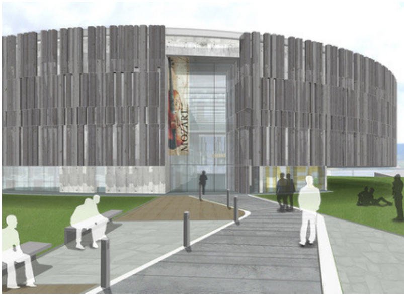
A new Cultural House in Akureyri in northern Iceland

The Icelandic Opera is also getting a new home. In Kopavogur close to Reykjavik there has been an architectural competition for an Opera House. Two projects were chosen to be further developed, and a winner will be chosen in June 2008. The plans are then to start the building process as soon as possible. The Opera Hall will have about 800 seats.