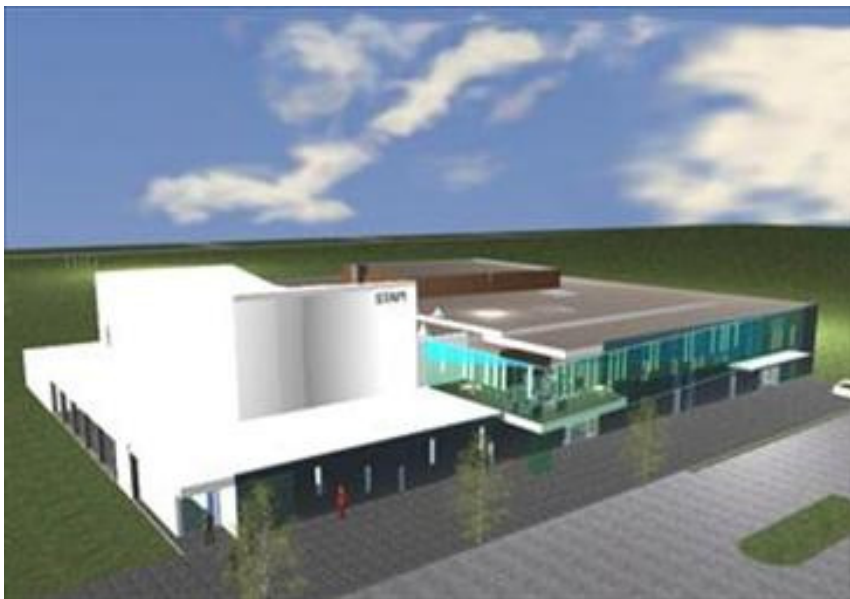
The Music House in Keflavik

In Keflavik (close to the airport) a “Music House” is being built. Here an old hall is rebuilt and beside it a music school is built with two smaller halls and besides that a Museum for Popular Music. The old hall will be a multi-purpose hall for all kinds of music: Classical, pop, rock and also musicals, theatre etc. Because the volume of the hall is too small for classical music, and also because of the demand for high flexibility, an electronic “help-acoustic” has been chosen with the VRAS- system. Acoustic consultants are the Icelandic firm VST.