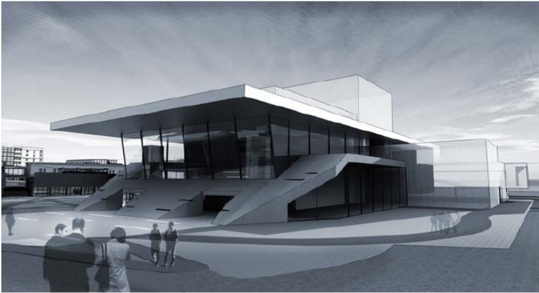
The Icelandic Opera. The other one of the two projects being further developed

In Keflavik (close to the airport) a “Music House” is being built. Here an old hall is rebuilt and beside it a music school is built with two smaller halls and besides that a Museum for Popular Music. The old hall will be a multi-purpose hall for all kinds of music: Classical, pop, rock and also musicals, theatre etc. Because the volume of the hall is too small for classical music, and also because of the demand for high flexibility, an electronic “help-acoustic” has been chosen with the VRAS- system. Acoustic consultants are the Icelandic firm VST.