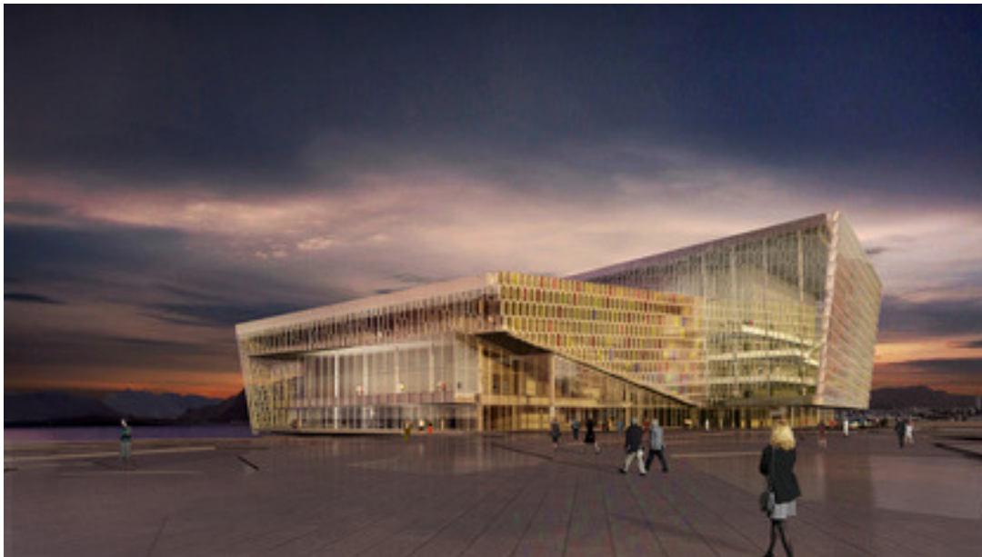
The new Reykjavik Concert Hall

In Reykjavik a concert hall is being built with “The Main Hall” for up to 1800 seats. Also a part of the project is a large Conference Hall, a Rehearsal Hall and a “Fourth Hall” for chamber music etc. (200 seats.) Acoustic consultants are Artek from USA and the house will be ready in December 2009. The house will be the home of The Icelandic Symphony Orchestra, but will also host single, larger opera events. There is an orchestra pit but not a full size stage tower.